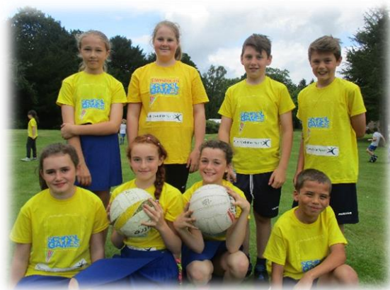
Our fantastic netballers!