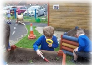
Our lovely repainted EYFS area in use!